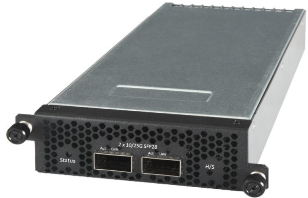
(I/O Module with 2 x 25G SFP28)

Interface Masters provides support for the Cavium SDK on multiple Linux distributions. Additional software and firmware enables rapid application development. Interface Masters offers Layer 1 and 2 support as well as software application development capabilities.