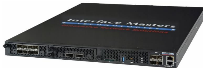
Tahoe 8724 (ISO View)

Target applications include network security appliance, Network Function Virtualization (NFV), Software Defined Networks (SDN), SSL/IPSec offload processing, 3G / 4G / LTE gateways, Unified Threat Management (UTM), Intrusion Detection Systems (IDS), Intrusion Prevention System (IPS), Data Loss Prevention (DLP), WAN optimization, Application Delivery Controllers (ADC), wireless controllers and load balancers.