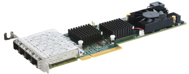
Sierra 3352 ISO View

In partnership with Cavium, Interface Masters offers this combined Network Interface Card with market leading NITROX III encryption off-load technology.