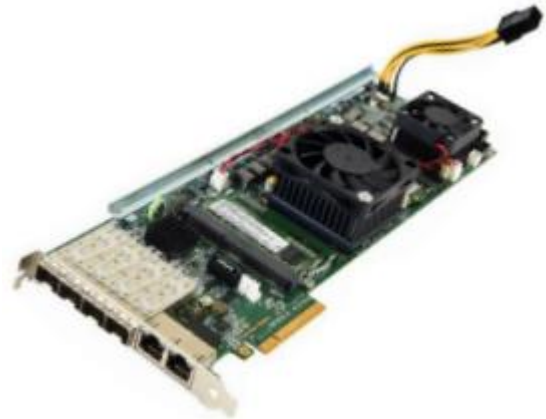
Sierra 732 ISO View