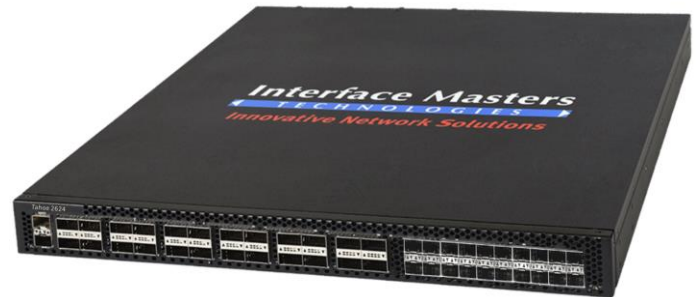
Tahoe 2624 (ISO View)