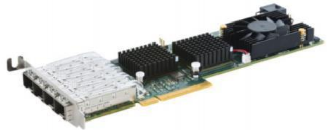
Sierra 3351 ISO view

In partnership with Cavium, Interface Masters offers this combined Network Interface Card with market leading NITROX III encryption off-load technology.