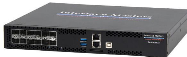
Tahoe 8822 ISO View