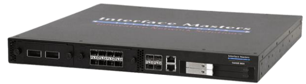
Tahoe 8824 (does not represent actual device)

All products are proudly designed and manufactured in the U.S.A.